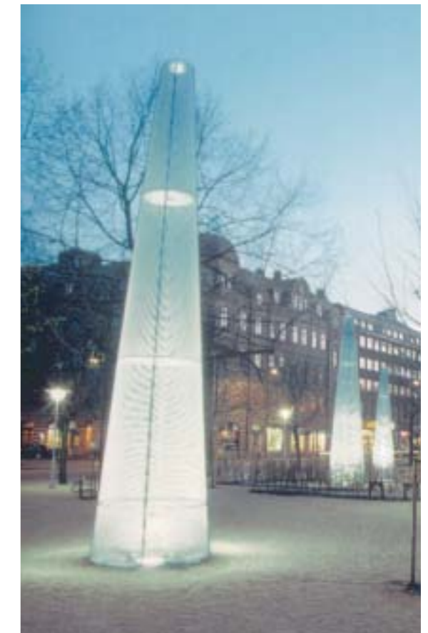
Light features to define edge of open space