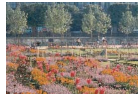
Create pockets of formal garden areas which may be sponsored by local interest groups