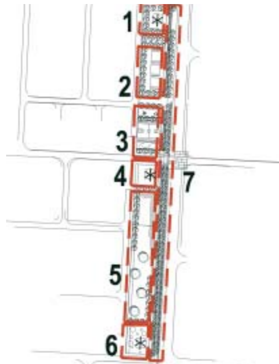
DIAGRAM DRAWING KEY