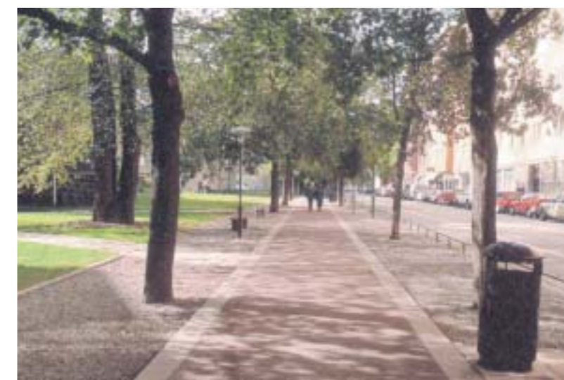
Avenue trees and pedestrian routes to eastern edge of open space