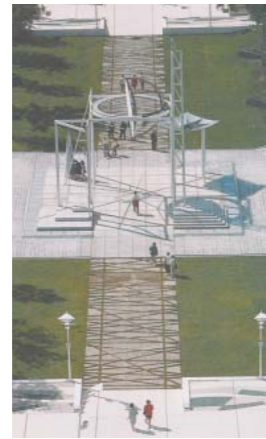
Features to create focal points