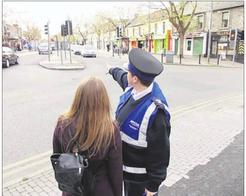
National Accessibility Week is being supported by APCOA Parking, who provide a parking management service on behalf of Dun Laoghaire Rathdown County Council, South Dublin County Council and Fingal County Council

On Thursday, December 1, from 10am to 4pm,