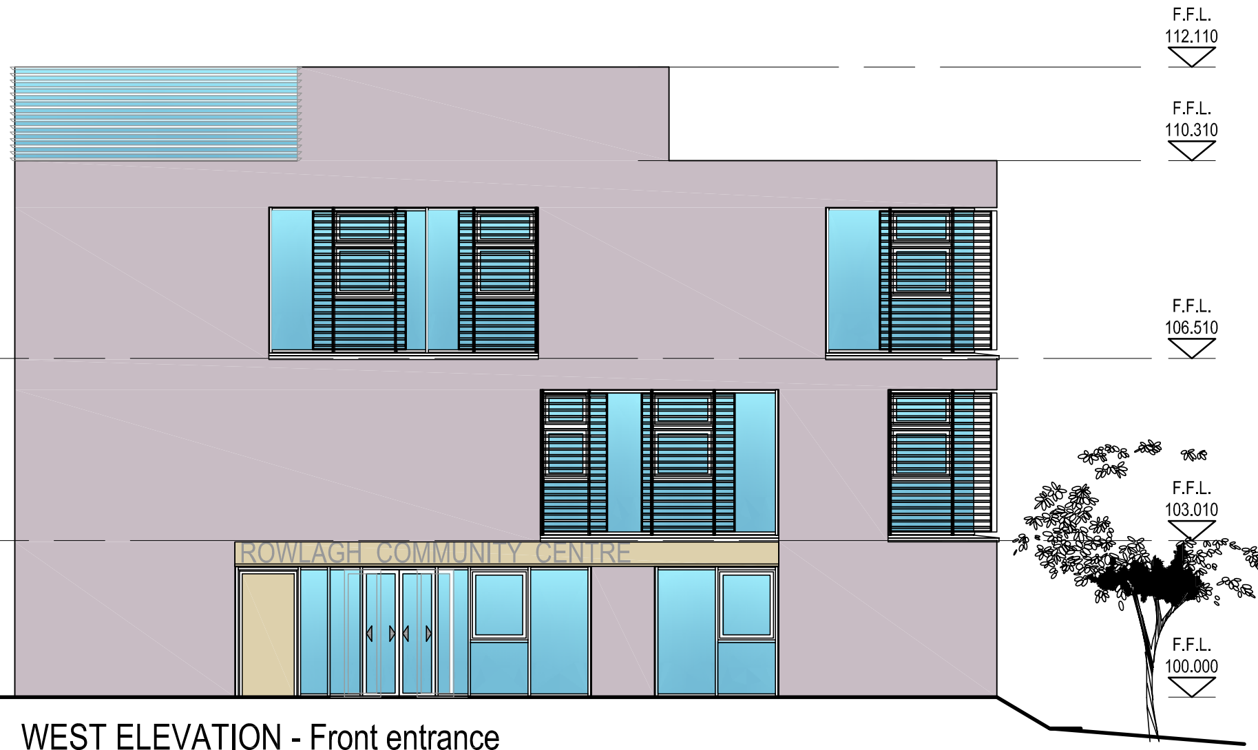
WEST ELEVATION - Front entrance

NOTE: COLOURS OF MATERIALS HAVE NOT BEEN FINALISED. THE WARM GREY RENDER SHOWN MAY NOT BE THE FINAL SELECTED COLOUR.