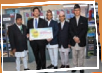
Nepalese Society of Ireland