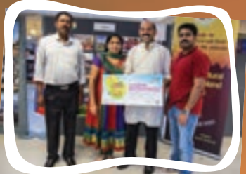
South Dublin Migrant Integration Forum