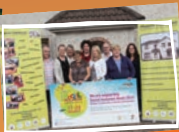
Phoenix Club House