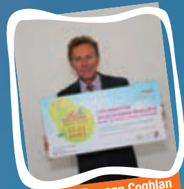
Senator Eamonn Coghlan