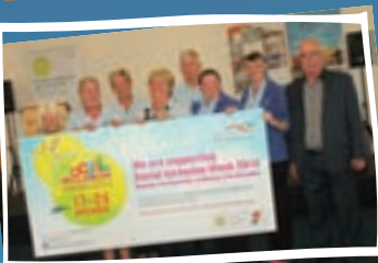
Dominics Community Centre