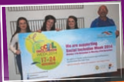
Tallaght Traveller Youth Services