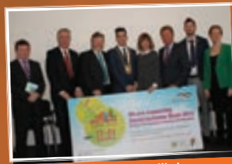
Launch of Health and Wellbeing Week