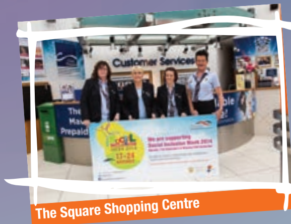
The Square Shopping Centre