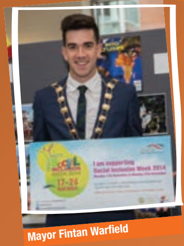
Mayor Fintan Warfield