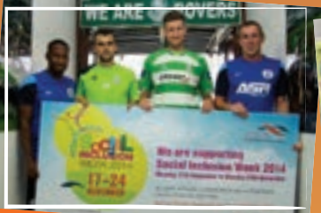
Shamrock Rovers and Queen Park Rangers

Tel: 01 414 9270 or 086 380 3060 or 086 043 1779