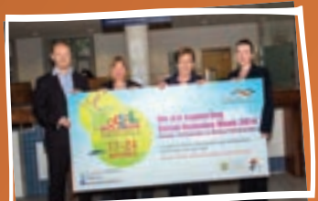
South Dublin County Council Customer Care