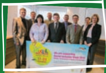
Management Team South Dublin County Council