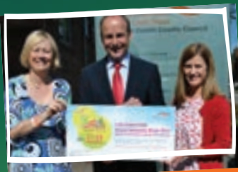
Micheál Martin, TD, and Social Inclusion Unit