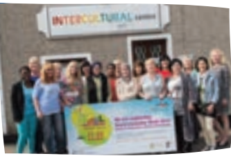
Clondalkin Intercultural Centre