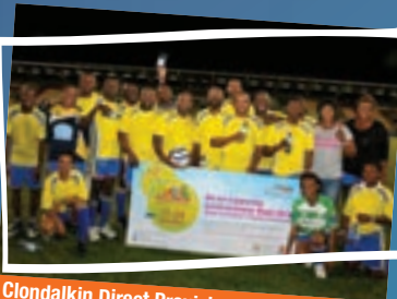
Clondalkin Direct Provision Centre