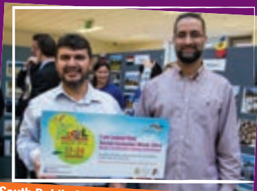
South Dublin Migrant Integration Forum

These classes will introduce children to Czech culture through songs, poems and folk stories.