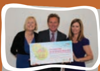
Senator Eamonn Coghlan and Social Inclusion Unit