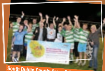
South Dublin County Council Councillors