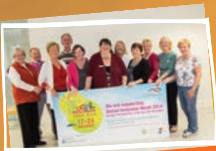
Tús Nua Active Retired