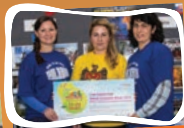
South Dublin Migrant Integration Forum