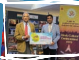
Hindu Cultural Centre of Ireland