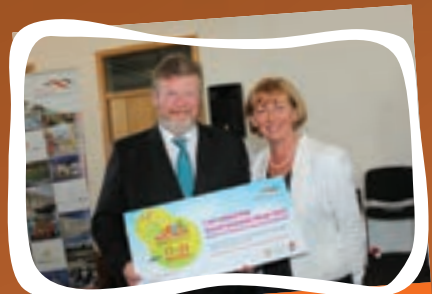
Minister James Reilly and Senator Cáit Keane