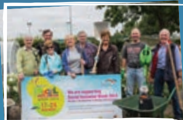
Grow Your Own Gardening Group