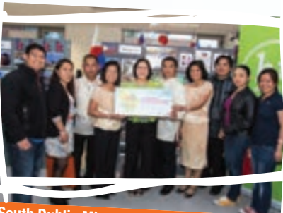
South Dublin Migrant Integration Forum

The purpose of South Dublin County Social Inclusion Week is to highlight and promote the positive work that South Dublin County Council is involved in to reduce social exclusion and poverty. It is a programme of events organised by the Social Inclusion Unit, Community Services Department to highlight the diversity and creativity of people in South Dublin County. The Unit reaches out into all sections of community, connecting many people and groups who are normally isolated and on the margins. It is an opportunity for people to learn new skills, share ideas and participate in their community.