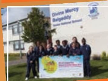
Divine Mercy School Lucan