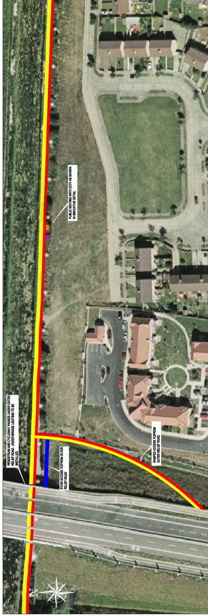
Plan: SCALE 1:500