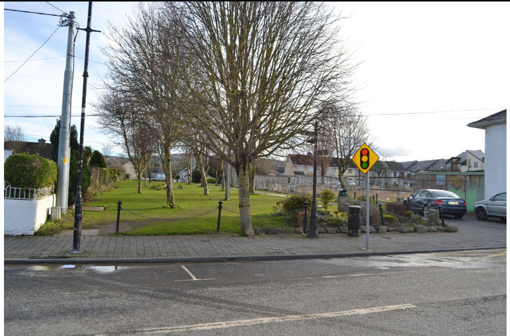
Photo of the Location for the new Village Plaza