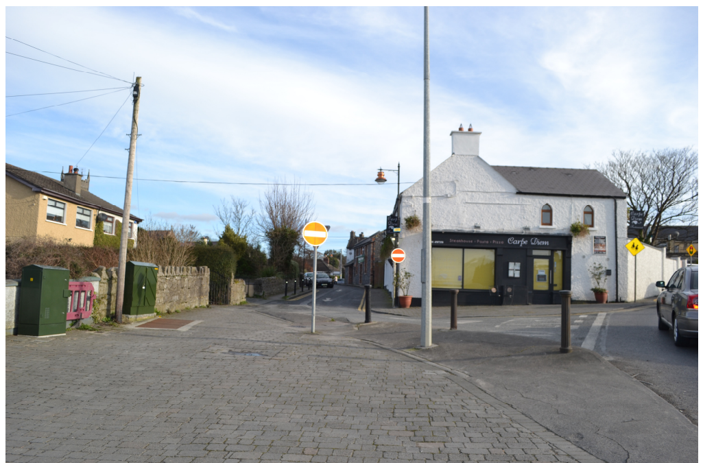
Photo of the Location for the new public Plaza at Mill Road

The area of the proposed plaza at Mill Road and the works to Mill Lane, is outlined in red and totals 918sqM.