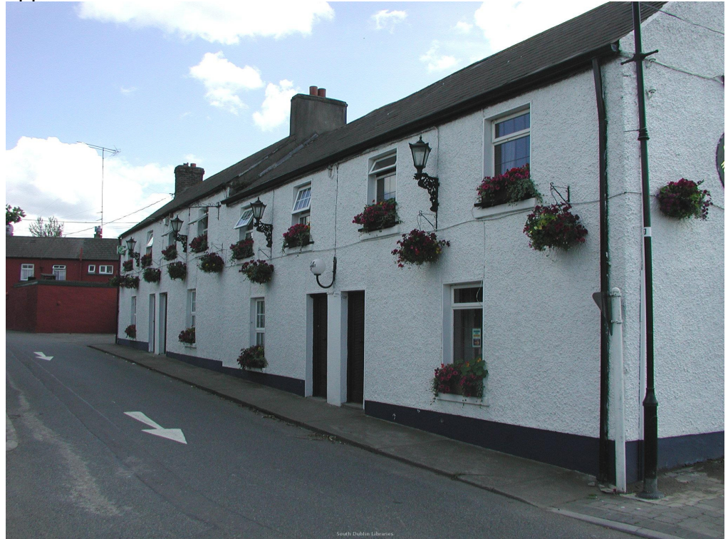
Photo of the Old Forge Bed and Breakfast 2002

Dating from 1880 according to the National Inventory of Architectural Heritage. The proposed works will not materially affect the external appearance or the character of this structure.