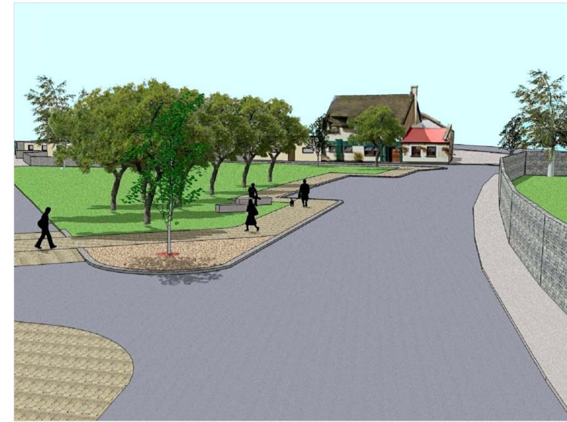
01 VILLAGE GREEN PERSPECTIVE VIEW 1 P8 NTS