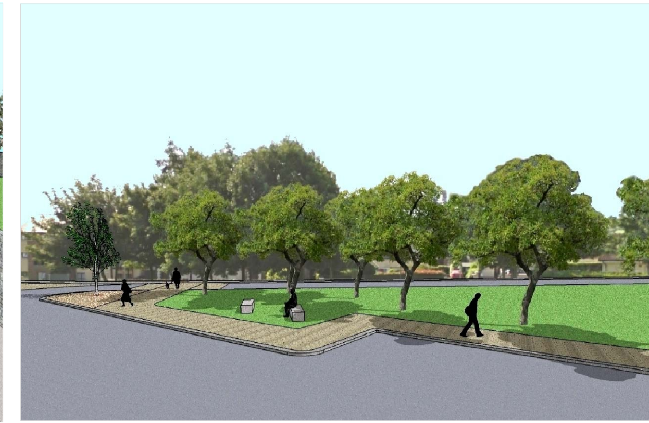
02 VILLAGE GREEN PERSPECTIVE VIEW 2 P8 NTS