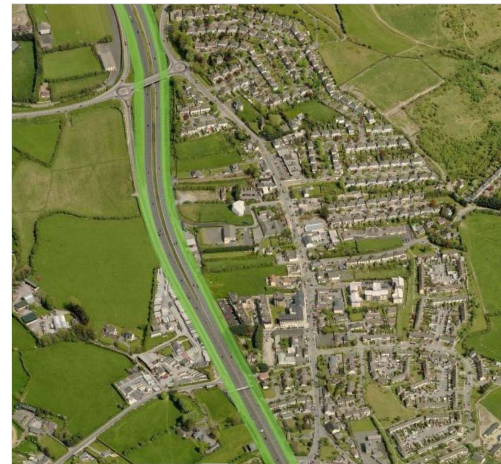
01 AERIAL VIEW OF RATHCOOLE VILLAGE SITE FROM THE WEST P8

The Villages Initiative launched in 2012 will assist to develop the villages as the accessible focus of walking and amenity networks for their adjoining communities. Increase the attractiveness and visibility of their village-centres increasing footfall and activity. The improvement of built and natural heritage assets will complement the promotion of community and social events (performances, festivals, open-air markets) in an enhanced public-realm optimising historical settings. Interaction will be facilitated with improved way-finding, building and route signage. The diverse range of services provided by each village will be enhanced as economic opportunities in relation to niche retail, local produce, and tourist attractors.