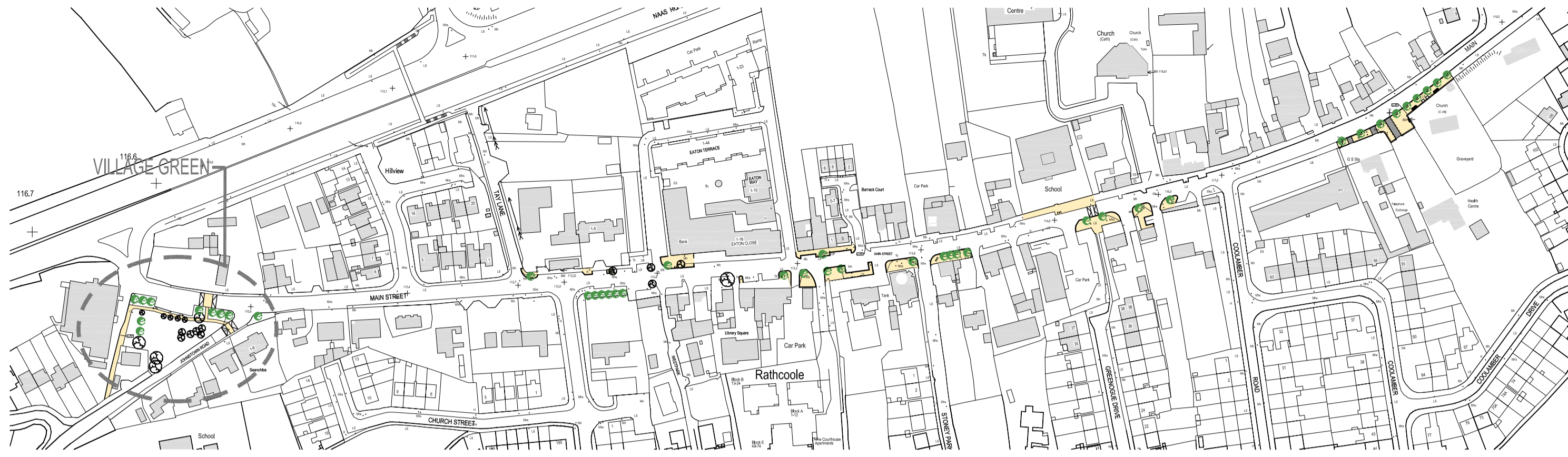
01 SITE LOCATION MAP P8 1:2500