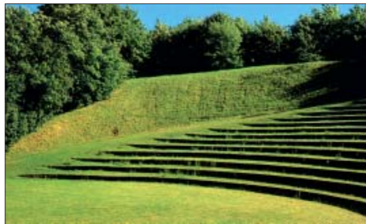
Use valley sides as informal seating areas