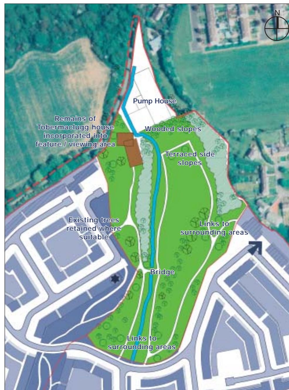
Indicative Park Layout 0 50 100 200 m

The existing steep sided slopes of the river valley will be terraced to allow maximum use for surrounding residents and to facilitate access for all. A bridge will allow access across the Tobermaclugg stream.