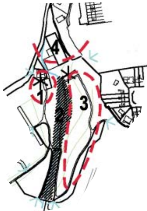
DIAGRAM DRAWING KEY