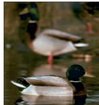
Develop the natural habitat value with improvement works to the stream