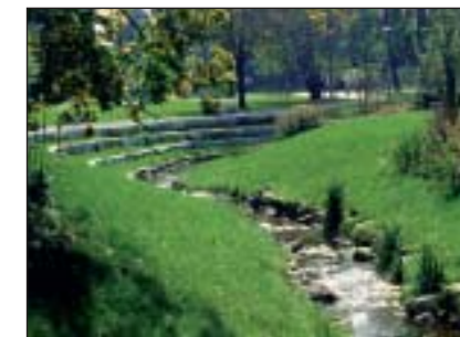
Integration of streams within open space areas