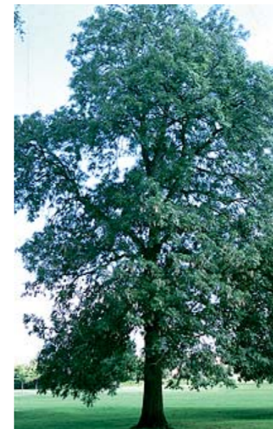
Develop the natural habitat value with native planting