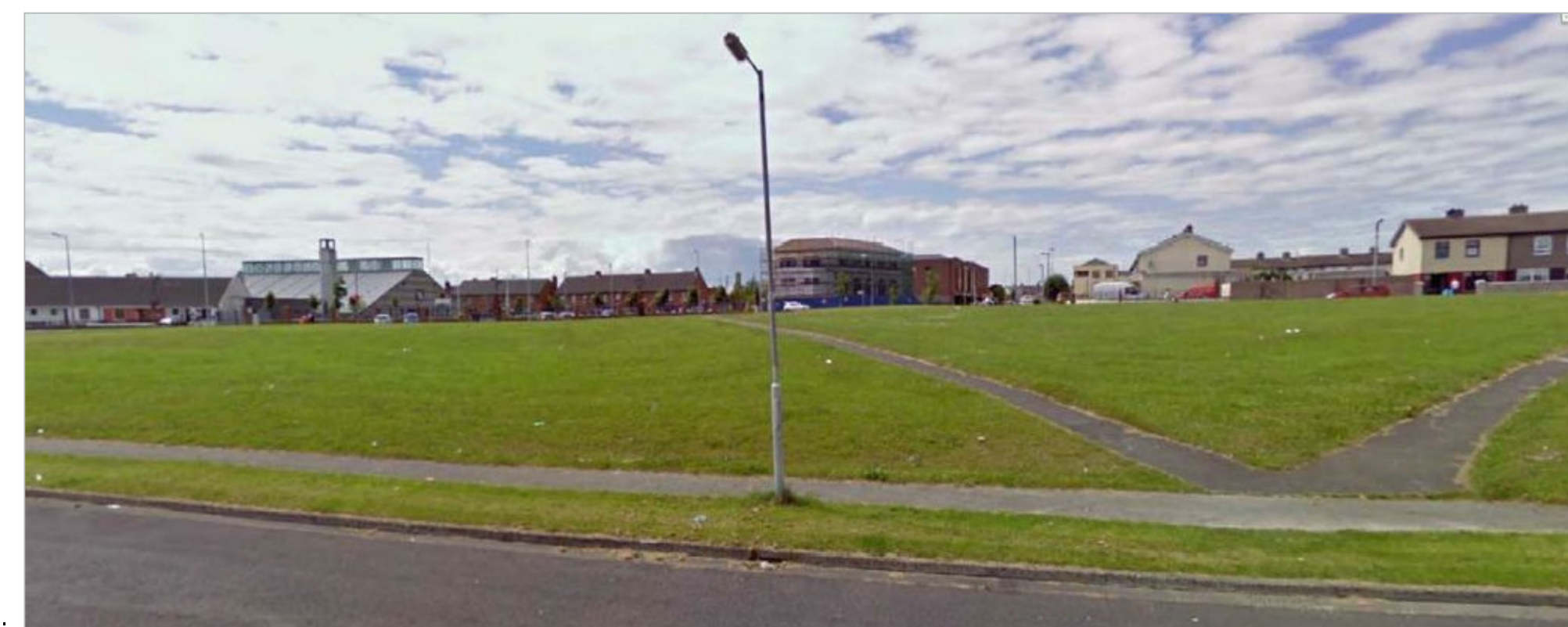
EXISTING SITE VIEWED FROM OATFIELD AVE.