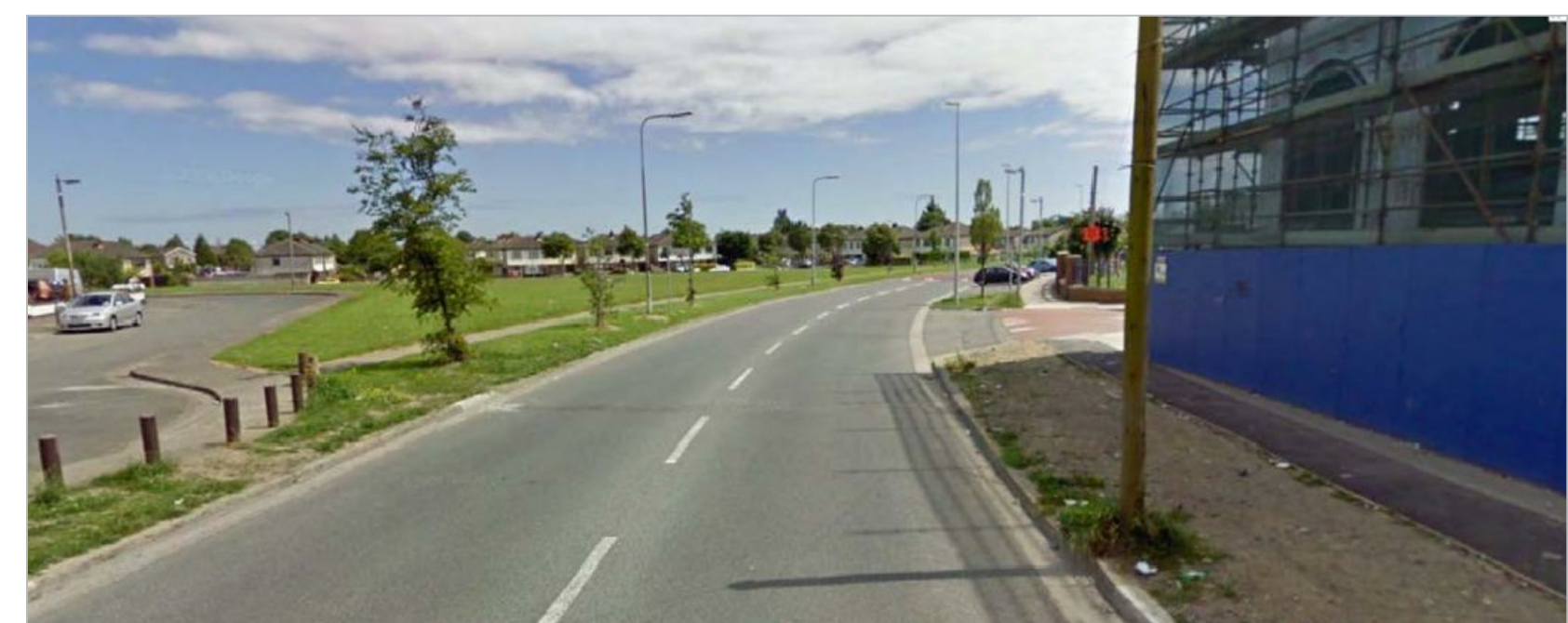
EXISTING SITE VIEWED FROM CREDIT UNION