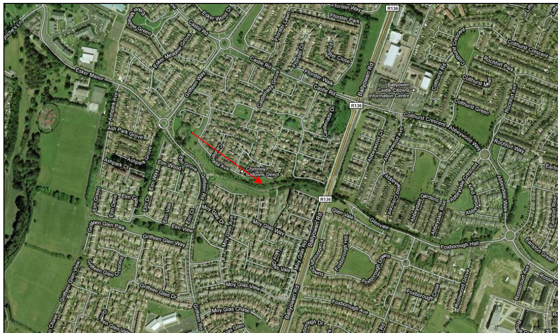
Figure 2.1.3. The esker at Ballyowen, Lucan, along which a walking and cycling route is proposed as indicated by the red arrow.