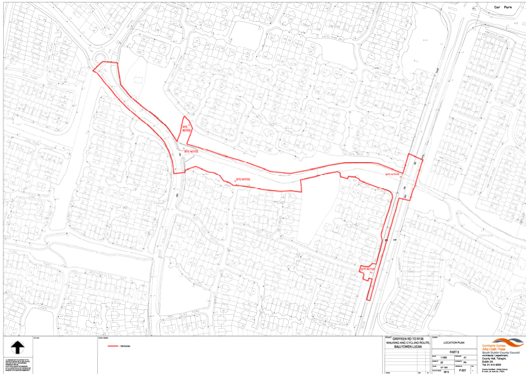
Figure 2.1.2. Lands proposed for the development of a walking and cycling route, at Ballyowen, Lucan, outlined in red.

At the eastern end of the esker at Ballyowen Road there are remnants of native dry calcareous grassland. This area of grassland is too small in extent and not rich enough in species to equate to the habitat '6210 semi-natural dry grasslands and scrubland facies: on calcareous substrates (Festuco-brometalia)' as listed under Annex I of the EU Habitats Directive.