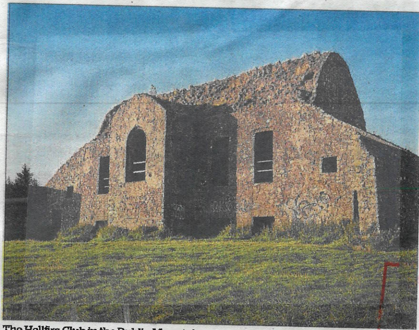
The Hellfire Club in the Dublin Mountains.