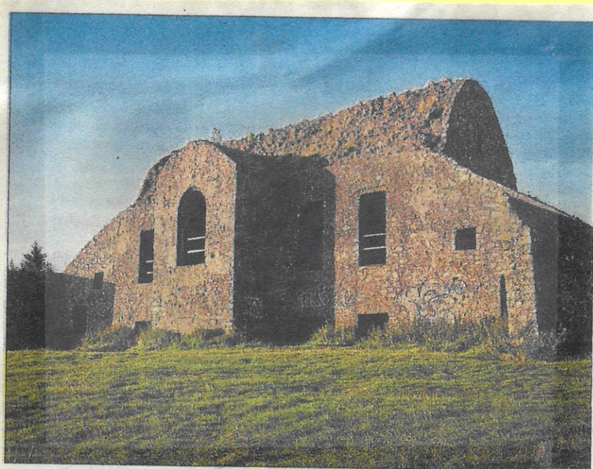
The Hellfire Club in the Dublin Mountains.

With reference to An Bord Pleanála case reference JA0040, I wish to lodge this submission to An Bord Pleanála and I have payed the fee of €50.00 euro. The applicants behind this proposal are South Dublin County Council and Coillte! The proposal is for a 75 seater cafe, a shop, changing facilities, a walkers lounge, exhibition space, an education centre, and a 50 seater auditorium. Design and Planning application by Paul Keogh architects.