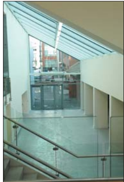
An inside view of the new County Library

While the administrative County of South Dublin came into existence as recently as January 1994, the area it serves has a long and varied history and possesses a rich heritage.