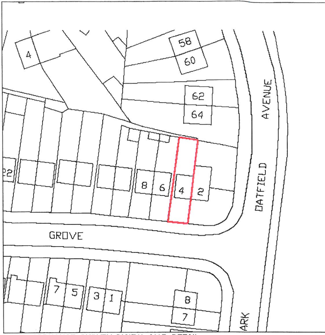
ALL ORDNANCE SURVEY DIGITAL MAP DETAIL