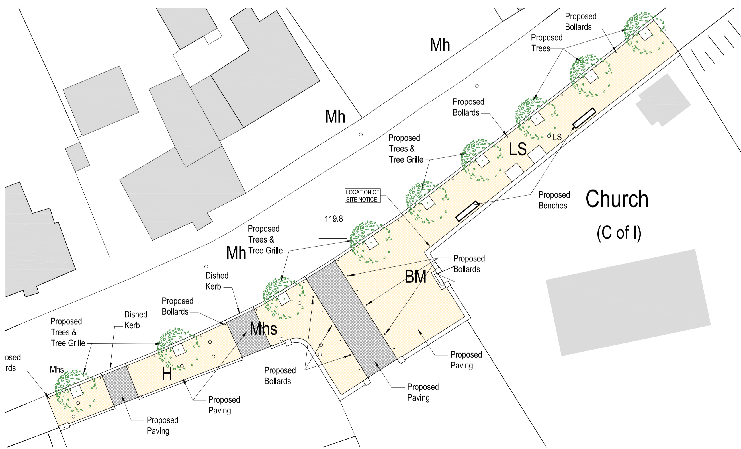
03 GATEWAY PROJECT PLAN P8 1:250