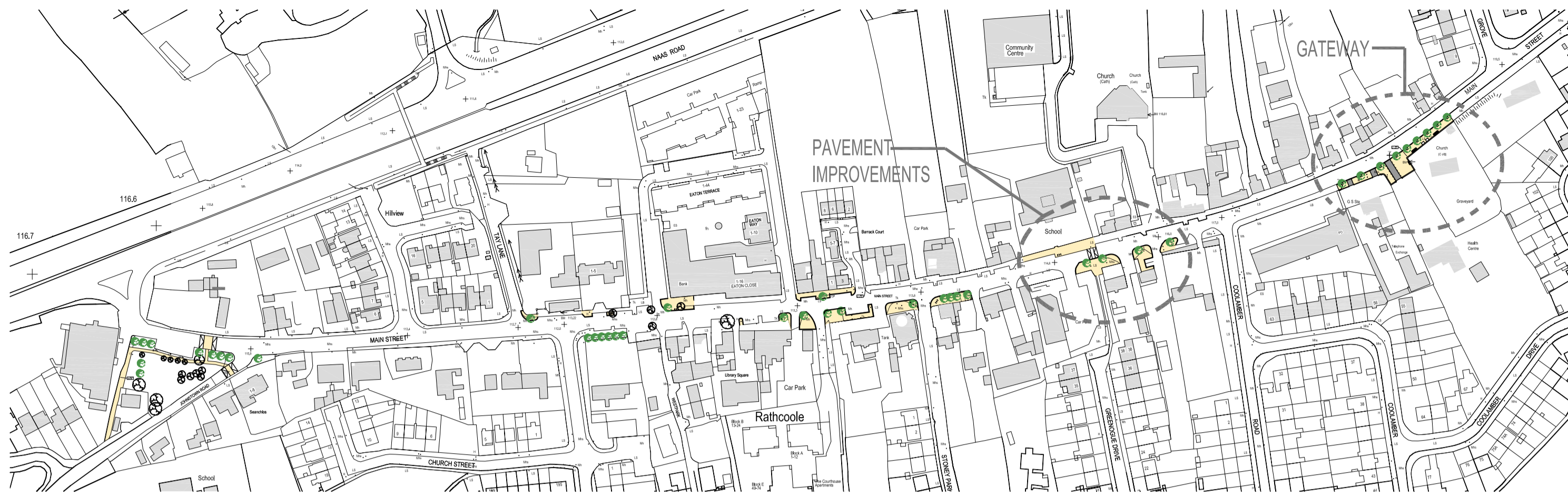
03 SITE LOCATION MAP P8 1:2500