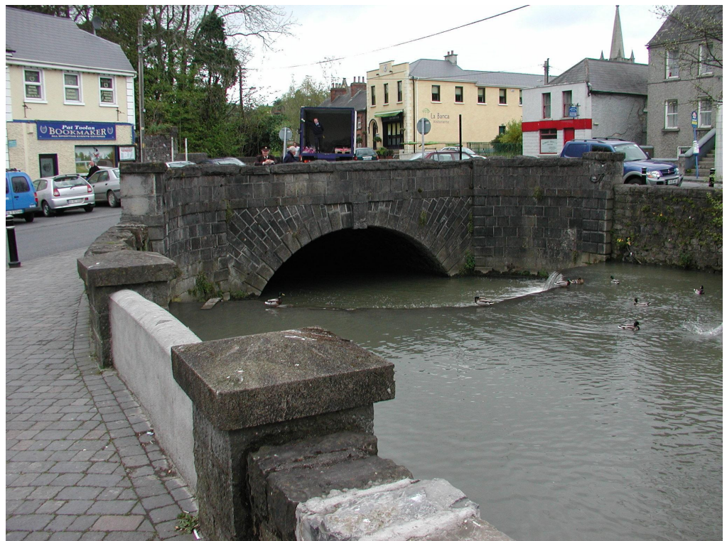
Photo showing blocked up opening in section of wall at Vesey Bridge in 2000