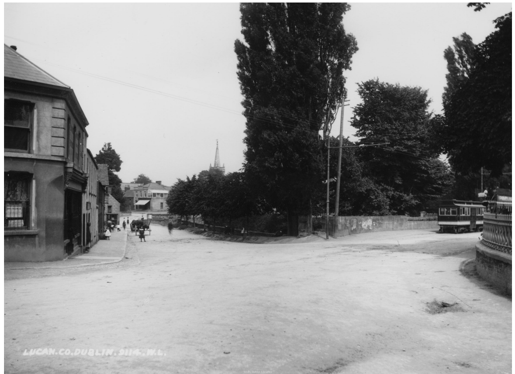
Photo taken from Griffeen Bridge looking toward Vesey Bridge in early 1900s

The proposed works to install a bridge crossing the canalised river and to make an opening in the wall will materially affect the external appearance or the character of this structure. The works will require the removal of a 3.5 metre long section of existing calp limestone wall along Main Street. The works will be carried out by a qualified stone mason and the opening will be properly dressed and finished so as to appear consistent with the surrounding wall. In mitigation, the proposed works are to a wall which has been altered in the recent past; the wall has been raised in height. Also this intervention is reversible.