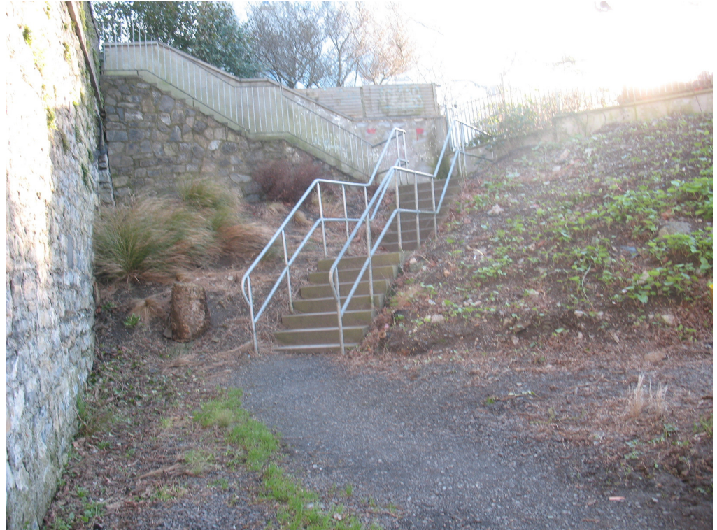
Recent photo of existing concrete stairs

The proposed works to install a new public stairs and access platform will not materially affect the external appearance or the character of this structure. The works will require the removal of a 480mm long section of existing calp limestone wall and granite coping along the south approach to Lucan bridge. The works will be carried out by a qualified stone mason using traditional skills and materials and the opening will be properly dressed and finished so as to appear consistent with the surrounding wall. In mitigation, the proposed works are to a wall which has been altered in the recent past; an opening in the wall has been made previously to permit access to the existing concrete stairs. Also this intervention is reversible.