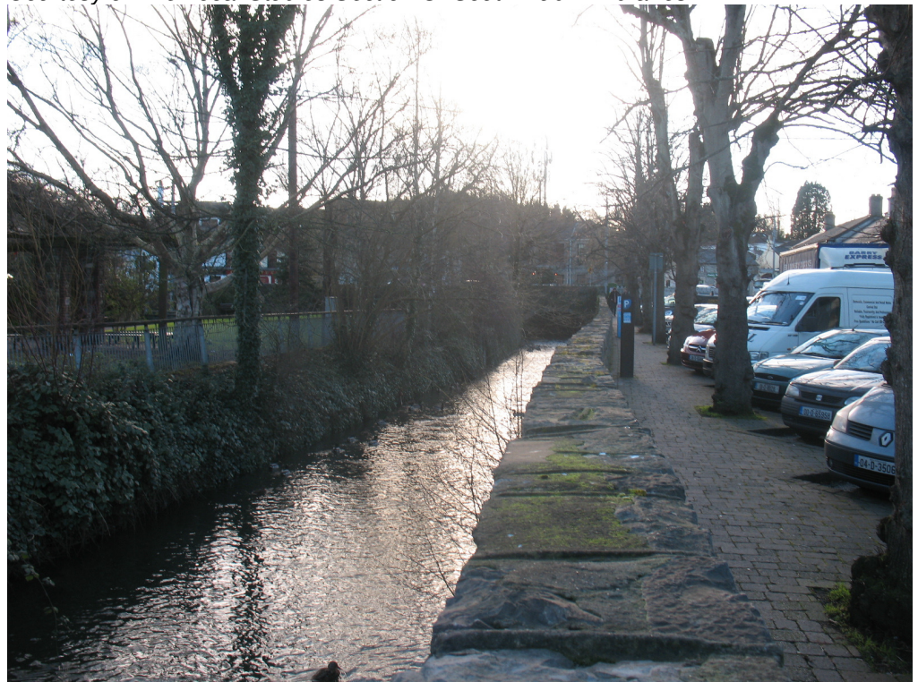
Recent photo of river showing raised wall and railings