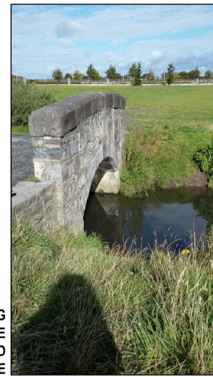
VIEW OF EXISTING PEDESTRIAN BRIDGE WITH OUTER RING ROAD IN THE DISTANCE