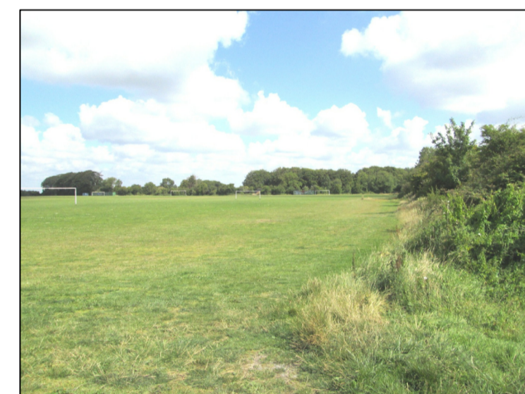
VIEW OF EXISTING PLAYING FIELDS FROM NORTH SIDE OF PEDESTRIAN BRIDGE