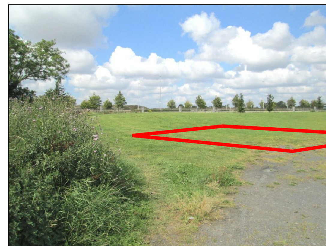
VIEW OF TOWARDS OUTER RING ROAD, FROM NORTH SIDE OF PEDESTRIAN BRIDGE, WITH PROPOSED PAVILION SITE IN FOREGROUND