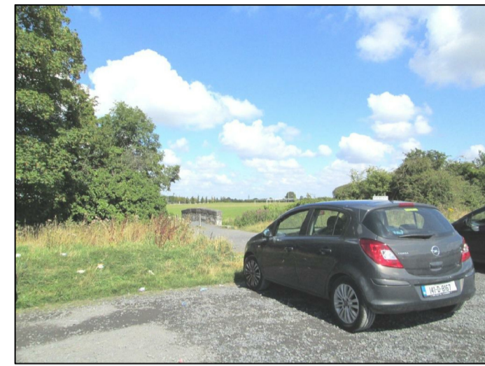
VIEW TOWARDS PLAYING FIELDS FROM EXISTING CARPARK OVER PEDESTRIAN BRIDGE

↑ EXISTING PEDESTRIAN/CYCLIST ENTRANCE TO PITCHES