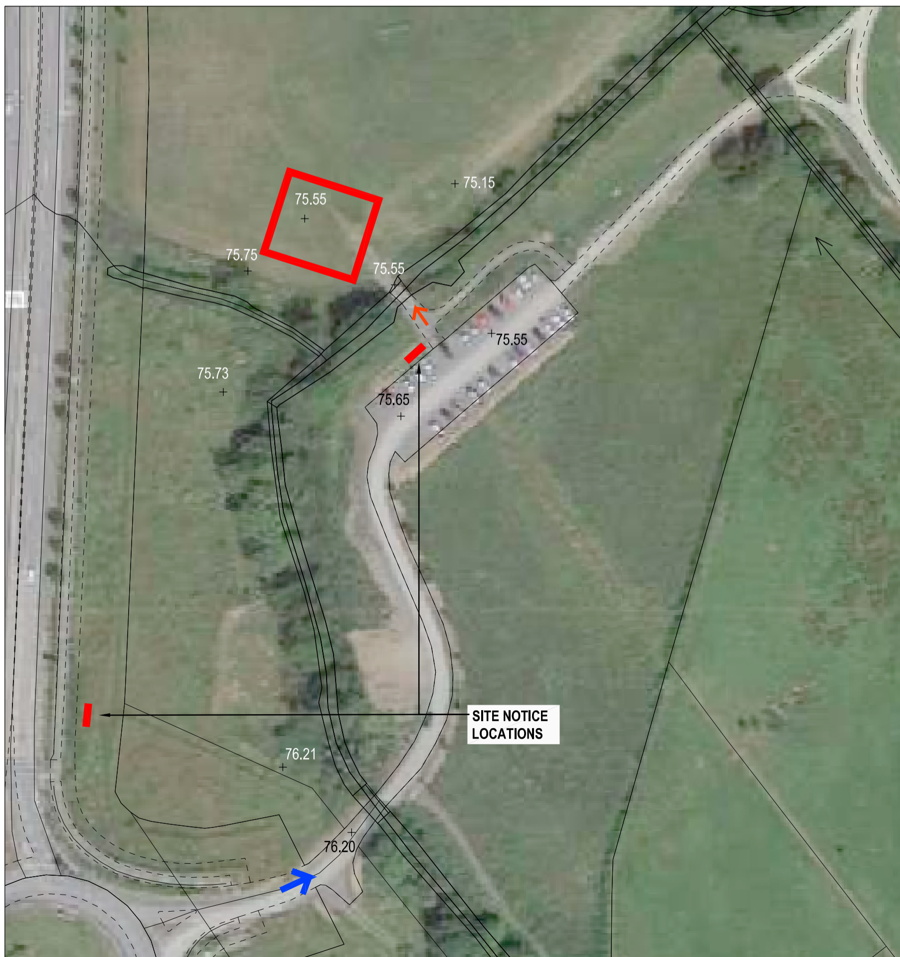
EXISTING SITE PLAN 1:1000