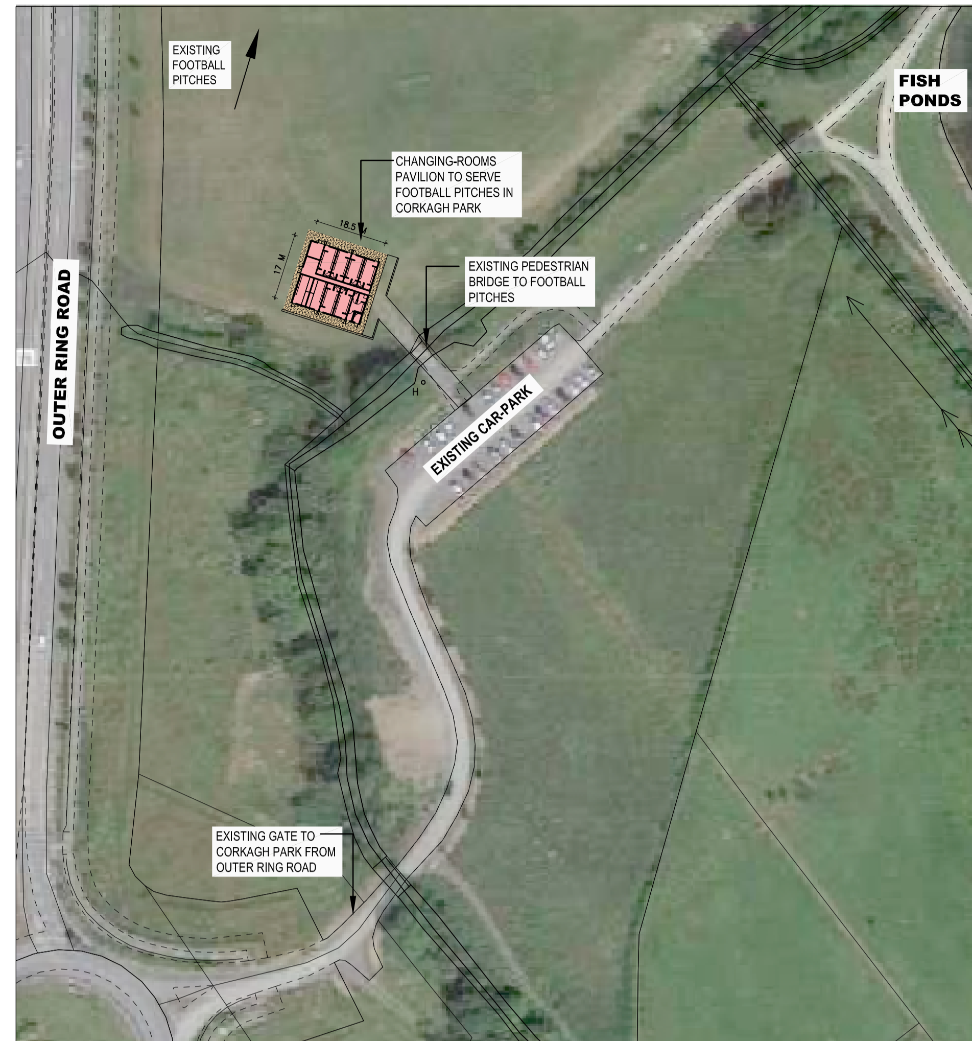
PROPOSED SITE PLAN 1:1000