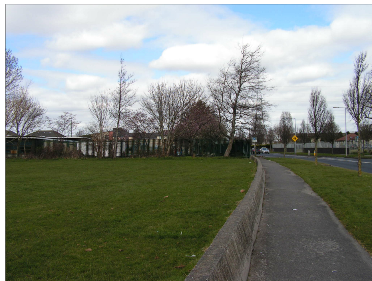
01 EXISTING IMAGE OF SITE