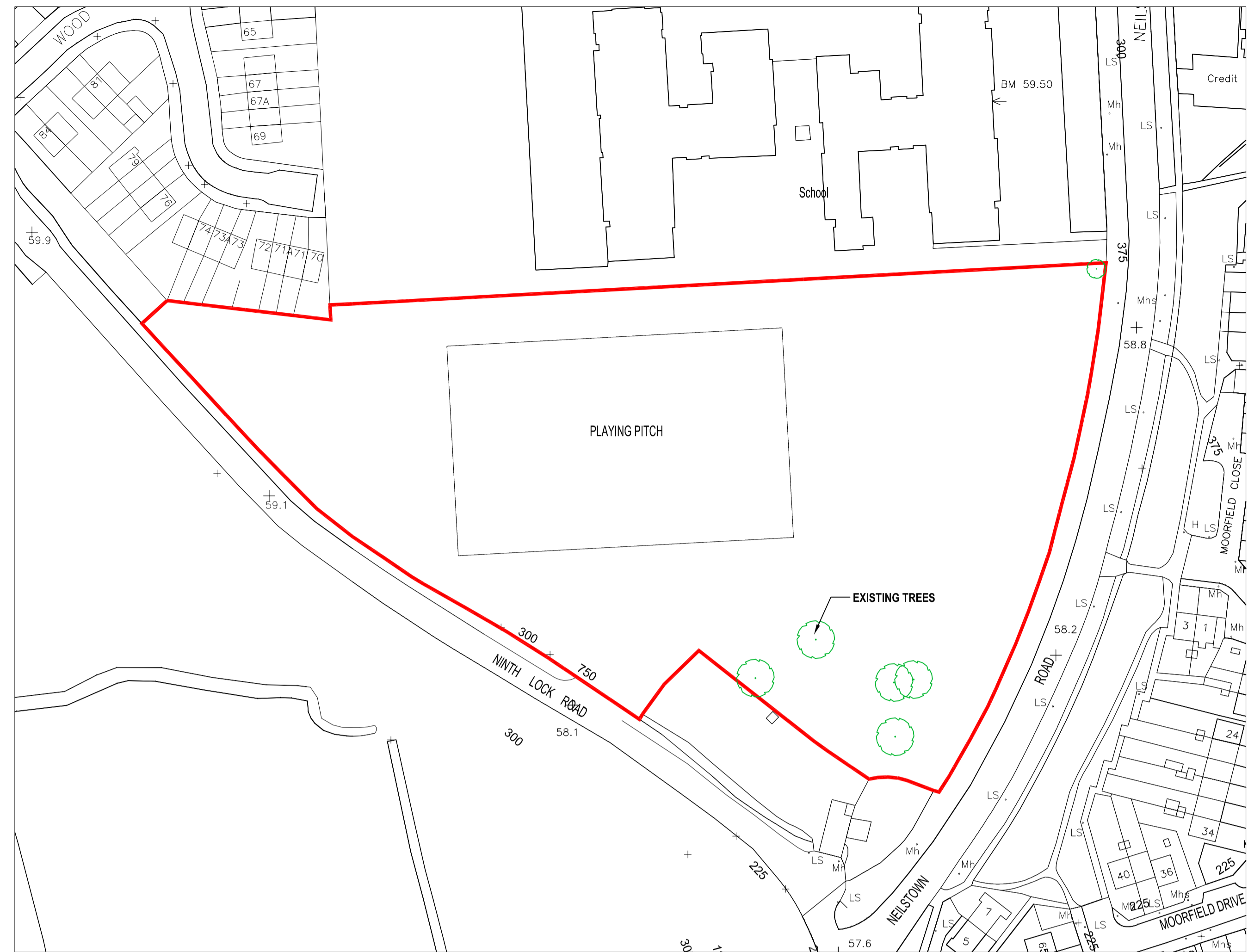
01 EXISTING SITE PLAN 1:1000