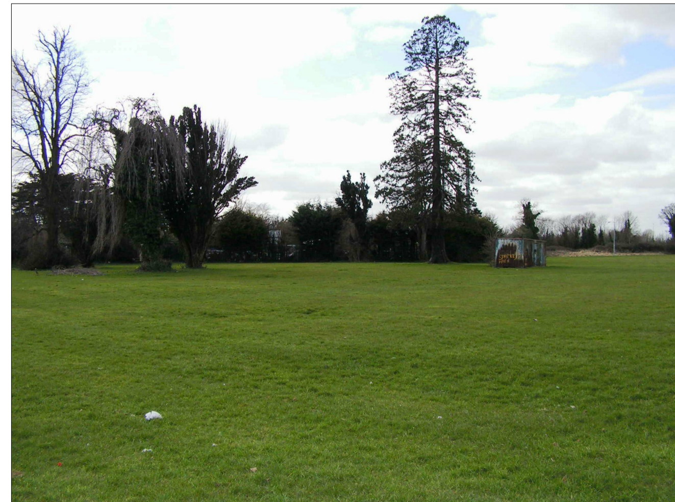
01 EXISTING IMAGE OF SITE