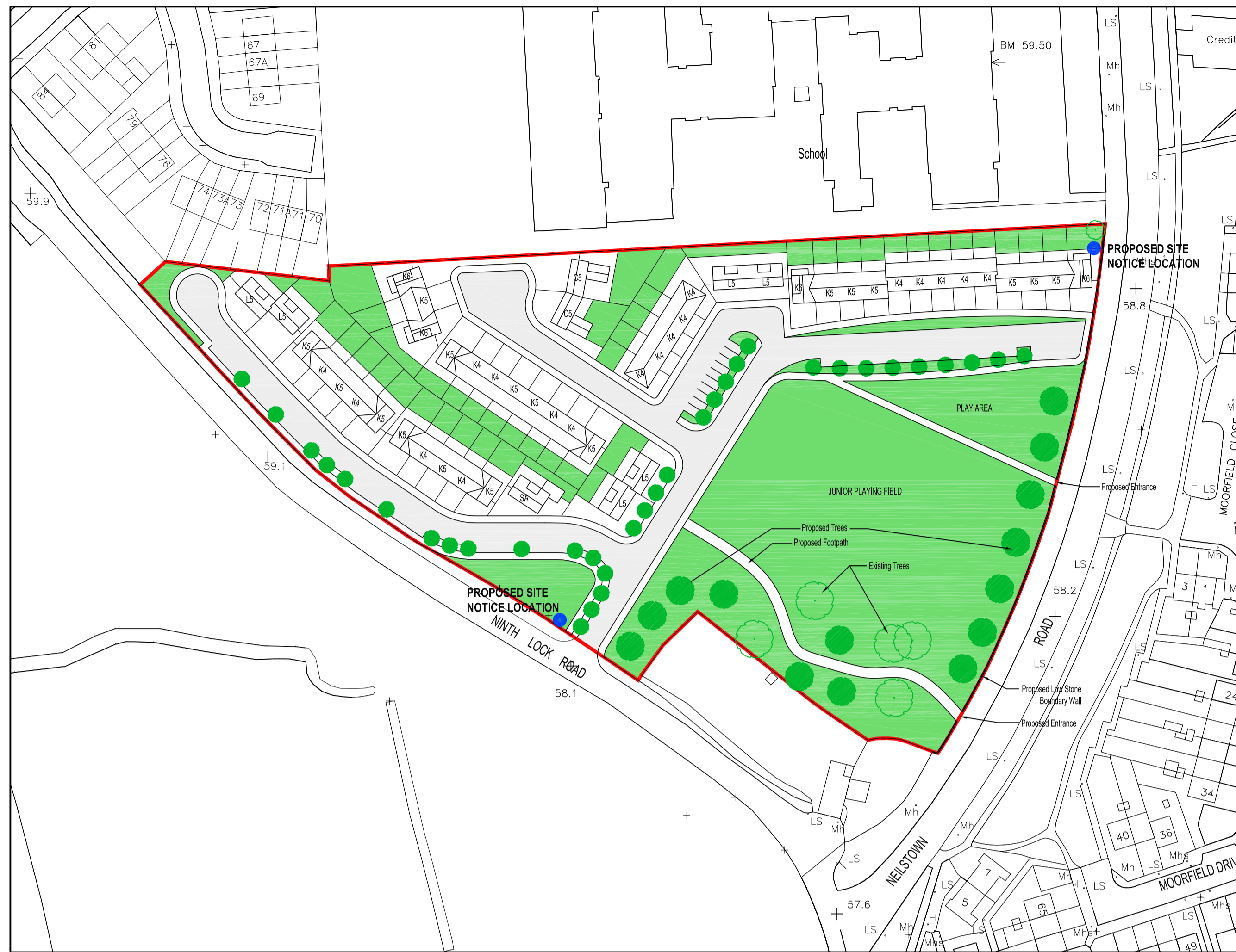
01 PROPOSED SITE LOCATION MAP 1:1000