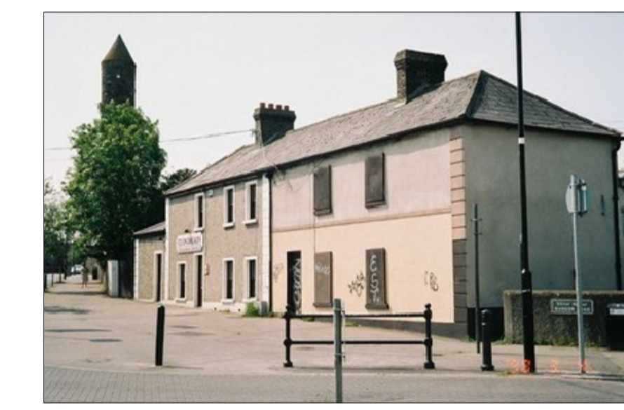
MILLVIEW TERRACE VIEWED FROM THE NORTH